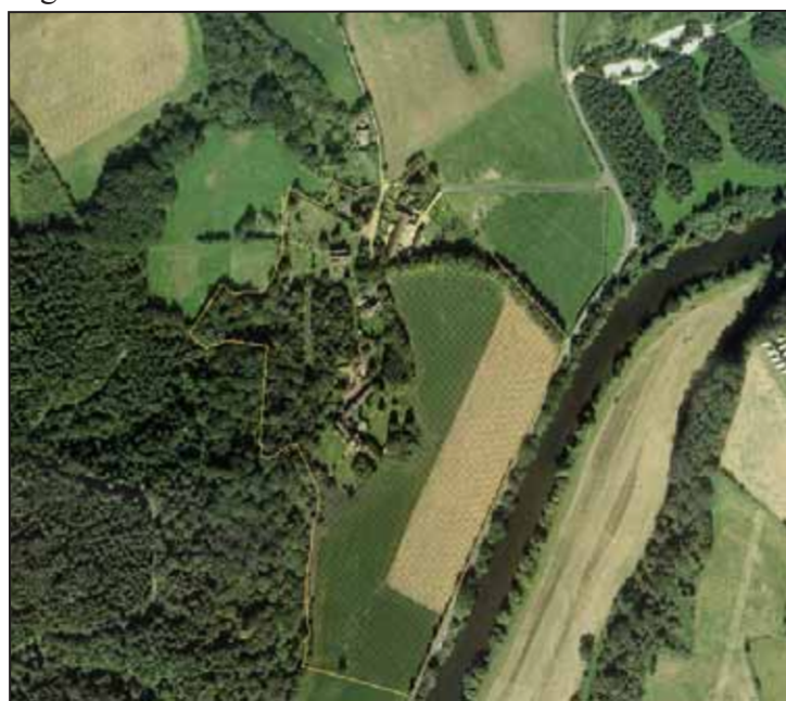
Aerial Photography Copyright © UK Perspectives.com

The underlying geology is one of a mix of sulphur coal and Old Red sandstone, whilst a small area of the Kidderminster Formation (Bunter Pebble Bed) lies immediately to the north, along with mudstones. Sand and gravel alluvial deposits are present along the edge of the River Severn.