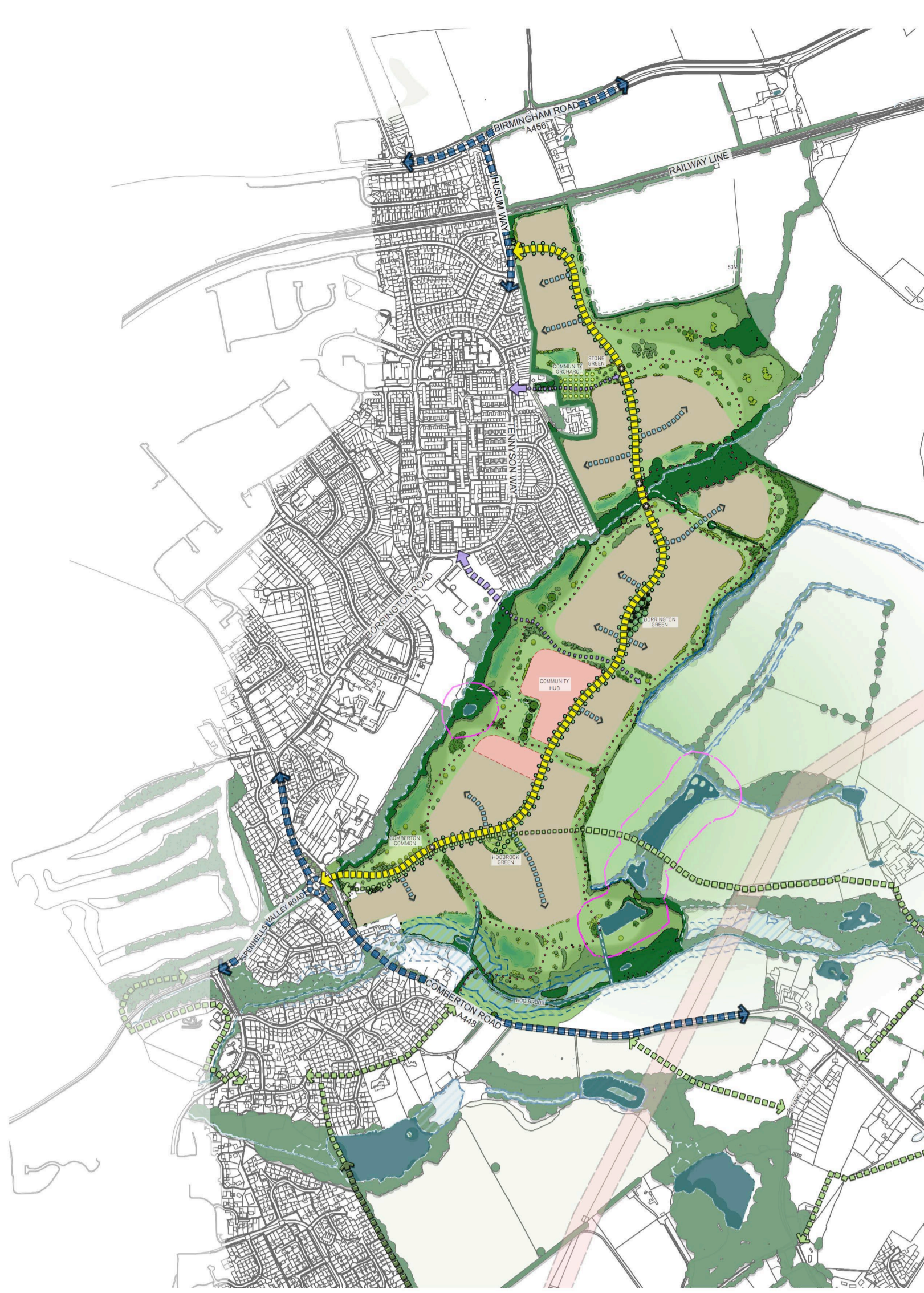
FULL SITE VIEW AND WIDER AREA (1/10000)